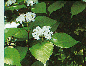
Wright viburnum ( Viburnum wrightii )

( Magnolia obovate ) The tree with the largest flower in Japan [Right of A-1 and other locations / May~Jun.]