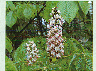
Japanese horse chestnut

The hanging pale yellow flowers have a pleasant aroma [Everyone's Square / Jul.]