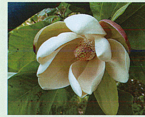
Japanese big-leaf magnolia

Cute, pink flowers [Around A-8 and other locations / May~Jun.]