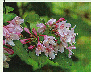
Japanese weigela ( Weigela hortensis )

Iwate's beautiful rhododendron [Commemorative Forest (roughly north of the gazebo) / May~Jun.]