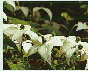
Kousa dogwood ( Cornus kousa Hance)

Climber; the exterior ornamental flower has one petal which distinguishes it from the tsuru hydrangea.