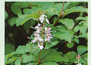
Hotsutsuji ( Elliottia paniculata )

The magenta flower has been loved since old times [Commemorative Forest / Aug.~Sep.]