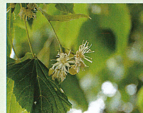
Japanese linden ( Tilia japonica )

( Rhododendron kaempferi ) A neat rhododendron glowing with new green shoots [Showa Forest / May~Jun.]