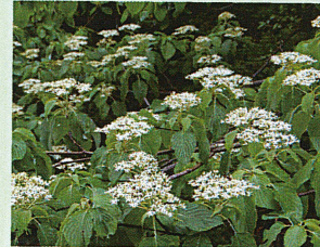
Giant dogwood ( Cornus controversa )

The visible white petals are a husk with the real bloom inside [Showa Forest / Jun.]