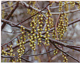
Kibushi ( Stachyurus praecox ) 【Apr.~May】