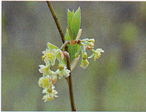
Oo-ba-kuro-moji ( Lindera umbellata ) 【Apr.~May】