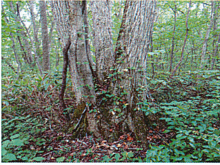
Japanese oak ( Quercus crispula Blume ) Produces large, elegant acorns in autumn which become a food source for forest animals. The wood is used to make whiskey barrels, etc.