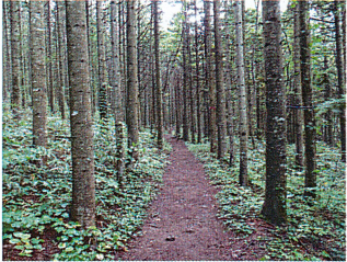
Sakhalin fir ( Abies sachalinensis ) Evergreen conifer. Planted in the area just before Nanataki Falls, you can enjoy walking in their unique atmosphere. Once you have come this far, Nanataki Falls is very close.