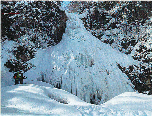
Frozen Nanataki Falls (Taken: 31 Jan. 2021)