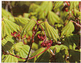
Full-moon maple ( Acer japonicum ) 【Apr.~May】