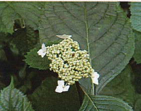
Ezo hydrangea ( Hydrangea macrophylla ) 【Jun.~Aug.】