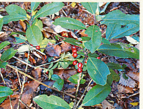
Hime-mochi with fruit ( Ilex leucoclada ) 【Sep.~Oct.】