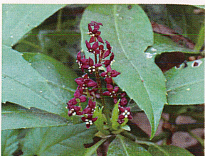
Hime-aoki ( Aucuba japonica ) 【Apr.~May】