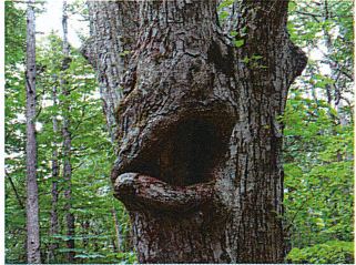
Japanese linden ( Tilia japonica ) Common in this area; their official name is Shina trees. Pictured is a tree hollow that looks like a mouth, called the 'face tree' and loved by hikers.