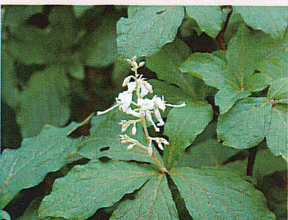
Hotsutsuji ( Elliottia paniculata ) 【Jul.~Aug.】