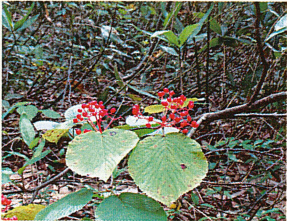
Oo-kame-no-ki with fruit ( Viburnum furcatum Blume ) 【Sep.~Oct.】