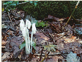
Indian pipe ( Monotropa uniflora ) 【Sep.】