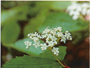
Wright viburnum ( Viburnum wrightii ) 【May~Jun.】