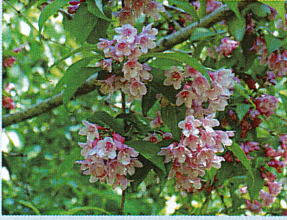
Japanese weigela ( Weigela hortensis ) 【May~Jun.】