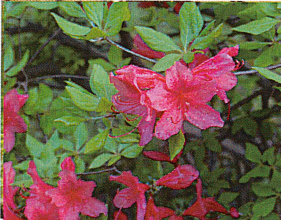
Torch azalea ( Rhododendron kaempferi ) 【May~Jun.】