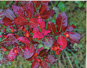
Komayumi tree with fruit ( Euonymus alatus ) 【Sep.~Oct.】