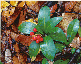
Tsuru-shikimi tree with fruit ( Skimmia japonica ) 【Sep.~Oct.】