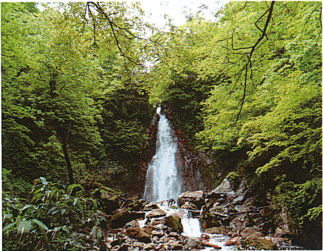
Nanataki Falls with new green leaves (taken: 1 Jun. 2021)

Many people visit from all over the country to see the new shoots of spring, the fresh green leaves of early summer, the vibrant autumn colors and the spectacle of the waterfall's completely frozen surface in the peak of winter. In each of the four seasons various flowers bloom and the trees change shape; so no matter the season, or how many times you visit, you can always enjoy the plentiful nature at the foot of Mt. Iwate.