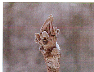
Japanese walnut ( Juglans mandshurica ) A wild walnut with winter buds and leaves like an animal's face