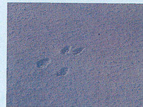
Japanese squirrel Direction of travel is slightly towards bottom left of image. Jumps with its large back feet (length of rear footprint : 5-6 cm)