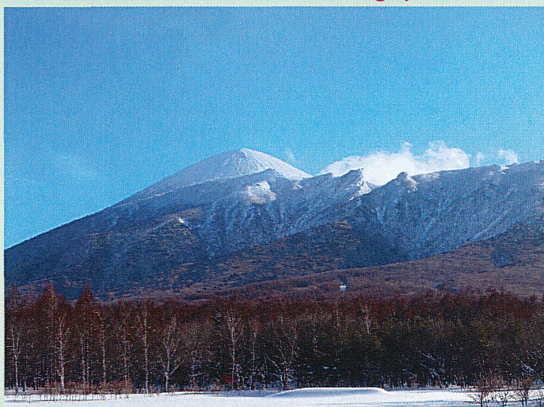
See the silver ridgeline of Mt. Iwate right before your eyes

Just a short walk from the museum is Iwate Prefecture's most superb viewing spot.