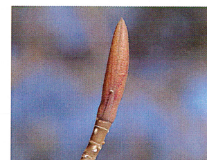
Japanese big-leaf magnolia ( Magnolia obovata ) Has the largest winter bud in Japan, as big as your index finger