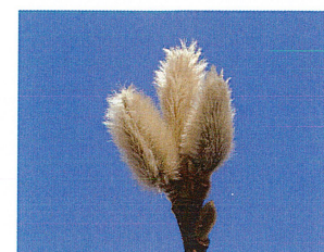
Star magnolia ( Magnolia stellata ) Protects new buds with a fluffy skin