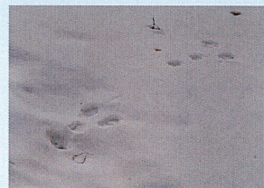
Japanese hare Direction of travel is towards top right of image. The back foot is larger. (length of rear footprint :14 cm)