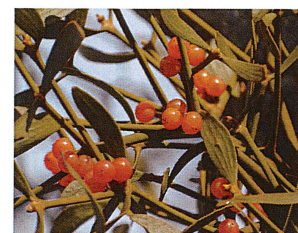
Japanese mistletoe ( Viscum coloratum ) Parasitic to other trees ; stands out with its red and yellow berries