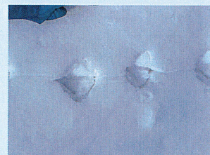
Copper pheasant Characterized by 3 prongs at the front (length of footprint : 6 cm)