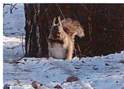
Japanese squirrel Eagerly eating a pine cone in a red pine forest