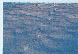
Japanese red fox Left and right footprints continue in almost a straight line (length of footprint : 4-5 cm)