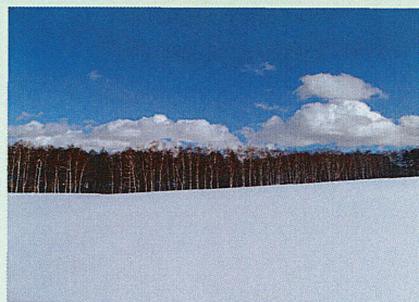
The corridor of birch trees is beautiful against a wide field of snow