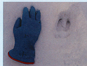
Japanese serow Has a hoof that is split in two (length of hoof : 5-5.5 cm)

Until now unseen, animals leave their footprints in the snow. If we are lucky, we might even meet their owner.