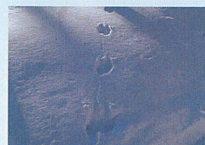
Japanese marten Moves like an inchworm (length of rear footprint : 3-5 cm)