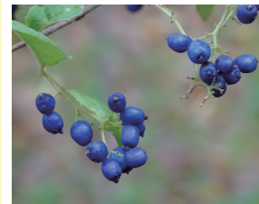
Sapphire berry ( Symplocos sawafutagi )

The trail to Nanataki Falls has many trees like maples whose leaves turn gold and on a fine day the forest glows.