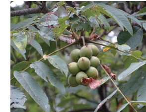
Manchurian walnut ( Juglans mandshurica )

Glossy, large acorns [Around A-2, B-7, Aug.- Oct.]