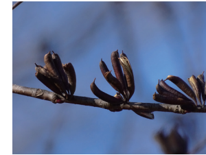
Katsura tree ( Cercidiphyllum japonicum )

Contains a type of walnut [Nanataki Falls trail, Aug.- Sep.]