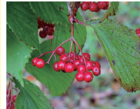
Wright viburnum ( Viburnum wrightii Mig.)

Small banana-like fruits that turn brown as they ripen [Showa Forest, Sep. - Jan.]