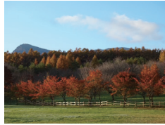
[Mt. Kurokura with karamatsu and cherry trees in autumn colors]

As the sky clears, you can enjoy the beautiful autumn colors with the Hachimantai mountain range as your backdrop. From the early red of the Sargent's cherry ( Cerasus sargentii ) which starts to change in late August through to the golden leaves of the karamatsu ( Larix kaempferi ) in early November, let us show you the brilliant colors one by one.