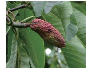
Japanese big-leaf magnolia ( Magnolia

1-3cm spherical, red fruits with pimpled exterior [Showa Forest, Aug. - Oct.]