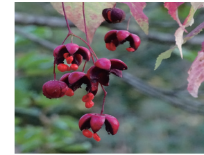
Spindle tree ( Euonymus oxyphyllus )

Bright red berries that are very popular with birds [Nanataki Falls trail, Sep. - Dec.]