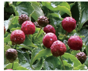
Kousa dogwood ( Cornus kousa Hance)

1-3cm spherical, red fruits with pimpled exterior [Showa Forest, Aug. - Oct.]