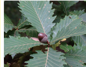
Japanese oak ( Quercus crispula Blume)

Flowing from Mt. Iwate and with a drop of 30m, this impressive waterfall is colored with autumn leaves. The journey from the Forestry Museum is approximately 3.6km and has a difference in elevation of about 250m.