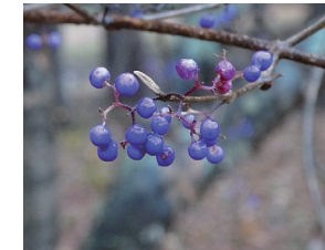
Japanese beautyberry ( Callicarpa japonica )

Lapis lazuli colored gem-like berry [Kiju Garden, Sep. - Nov.]