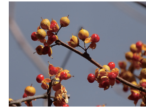
Oriental bittersweet ( Celastrus orbiculatus )

Hanging pink fruits with red seeds inside [Showa Forest, Sep. - Oct.]