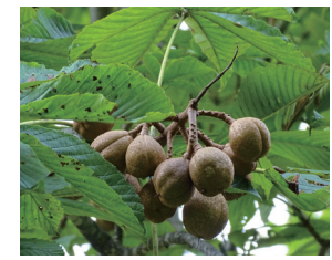
Japanese horse chestnut ( Aesculus

obovata ) Releases a vermilion colored seed when it ripens [Right of A-1, Aug. - Mar.]